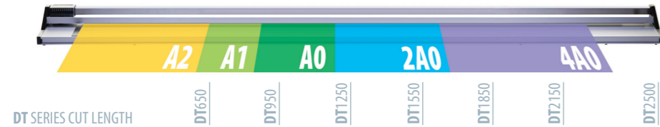
DT SERIES CUT LENGTH