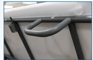
Handlebar under the table for easy maneuvering of materials and rotating from vertical to a flat position.

For more information and to see a video of this exciting lifter, please visit go-foster.com/AllABoard or scan this code with your phone.