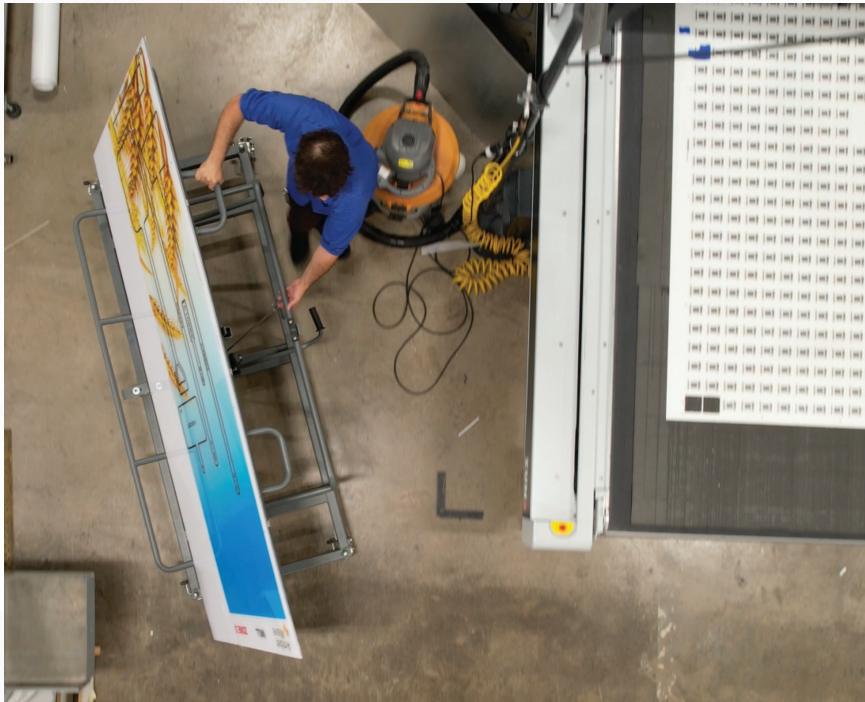
Save time with Foster's new Lifter that easily slides through doorways—no more carrying jobs to a workbench or printer.