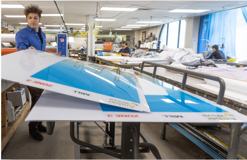
Deck rails keep 8" stacks of rigid substrates from shifting and moving during transport and loading.