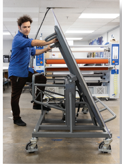
The tilt down and locking feature lets the operator safely move heavy rolls from horizontal to vertical position.