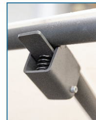
Latch releases and locks on top of work surface.