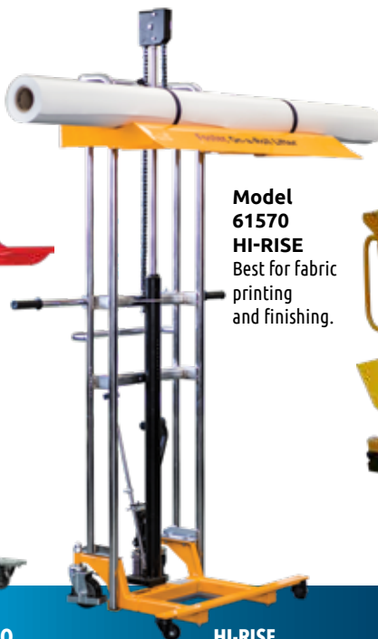
Model 61570 HI-RISE Best for fabric printing and finishing.