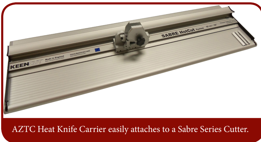
AZTC Heat Knife Carrier easily attaches to a Sabre Series Cutter.

Toll Free: 800-523-4855 Phone: 267-413-6220 Fax: 267-413-6227 204B Progress Drive, Montgomeryville, PA 18936 www.go-foster.com