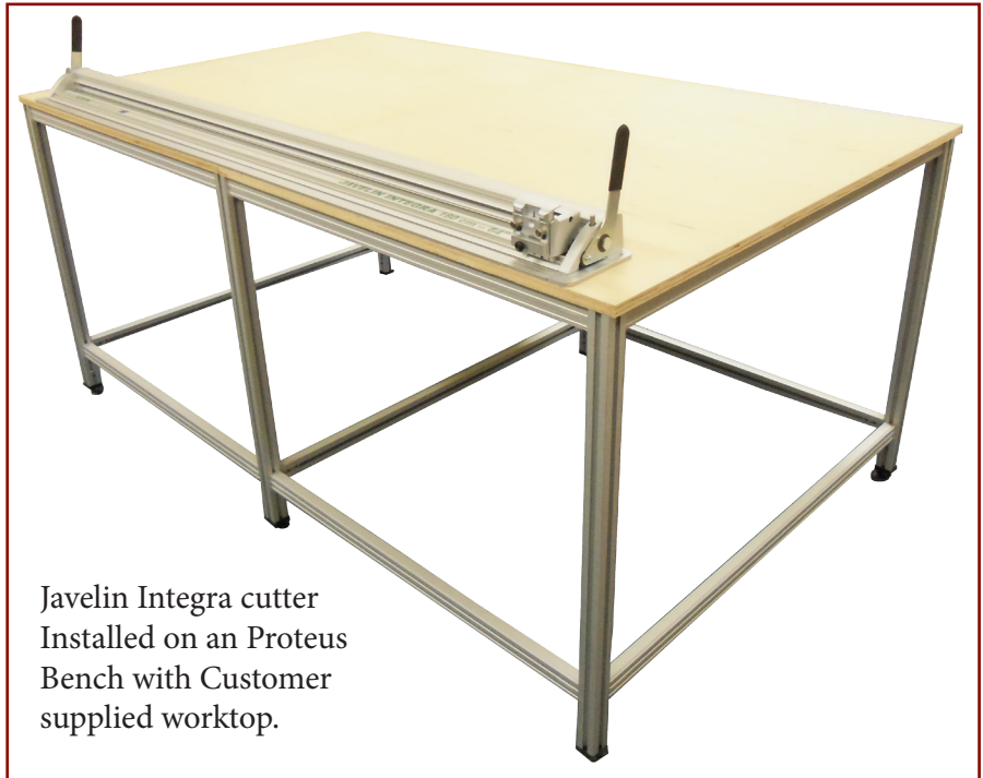
Javelin Integra cutter Installed on an Proteus Bench with Customer supplied worktop.

Any bench or table unit can be fitted with a customer-supplied top of choice. Recommended to use ¾" thick MDF or finished plywood.