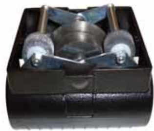
DTHEAD (Complete Cutting Head)